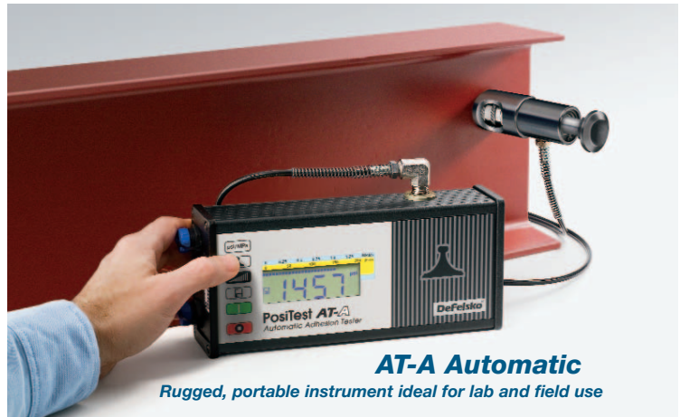
AT-A Automatic Rugged, portable instrument ideal for lab and field use