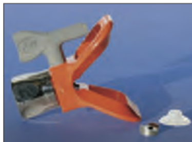
You can use the new XHD tips in the old GHD guards. Order 247634 Seat and Seal Kit. (5-pack)