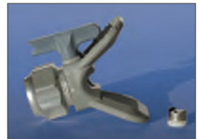
You can use the old GHD tips in the new XHD guards. Order XHD010 Seat and Seal Kit. (5-pack)